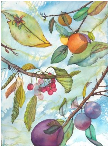
Artist: Karen Kramer Title: Harvest Bounty Materials: Watercolor on paper