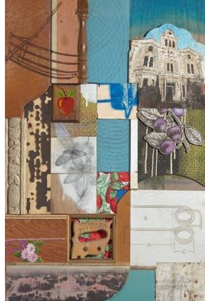
Artist Jeffrey Hantman Title: B, A, C Materials: Mixed media on wood panel