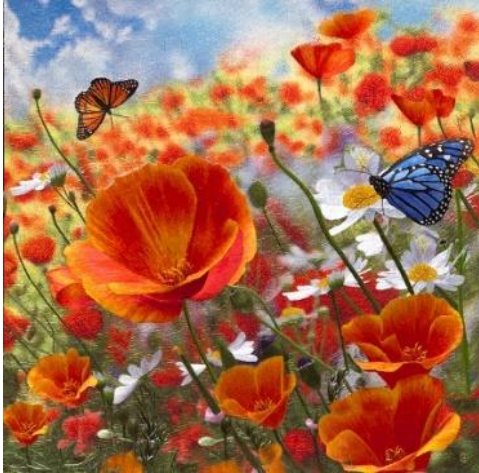
Artist: Yan Inlow Title: Butterflies Enjoying Poppies on a Spring Day #1 Materials: Silk embroidery

Four artists were selected to create framed artwork that is permanently installed throughout the public spaces of the Center. The artists each created a small series of 2-4 artworks inspired by Cherryland's community, history, gardens, and the Meek Estate. Below is a selection of the work.