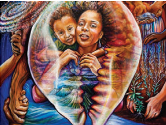
Universal Connection , 2012, acrylic painting on canvas, 30 x 40 inches