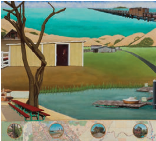
Where We Play: Floating Along , 2013, mixed media on wood panel, 32 x 36 inches