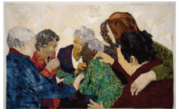
Circle of Friends , 2012, fiber, collaged and stitched, 33.5 x 53 inches

Juana Alicia's paintings portray nurturing and healthy human relationships in vibrant environments. Each painting features human figures engaged in a giving gesture or exchange. The figures are embraced by elements of the natural and healing world. Juana Alicia describes the painting Universal Connection as "representing the human connection with a balanced universe. The mother and child within the cowrie shell, the hands supporting and embracing each other, and hands watering and tending the crops, all express the energy of connection and cooperation."