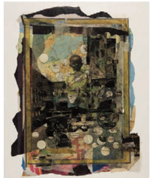
Avenues Along the Key System Route, 2012, mixed media, 33.5 x 27.5 inches

Mildred Howard's work is about memory, place, history, and family. This series of work is made of several layers of collaged elements which are digitally manipulated, printed, and hand-altered; buttons are added to give another dimension. "I began with the use of photographs of images known and unknown, scraps of paper, maps, pieces of silkscreened images and Japanese rice paper. The layering together of these elements into collages is a way that I begin to develop my ideas. It is for me a walk through time... I constantly go back and forth trying to create a dialogue with the material and the images used. Each fragment is significant to the other."