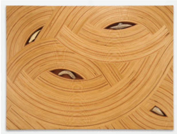
Flow, 2012, wood, 30 x 48 x 2 inches