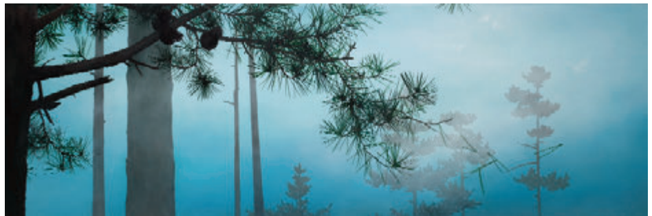
Coastal Pine , 2012, oil on aluminum, 16 x 48 inches

Yvette Molina's portraits of plants and natural settings invite the viewer to step inside another world with their meditative qualities and soft, calming colors. "Painting gives me an excuse to linger on a part of the world most of us have access to, but often ignore in the pursuit of our daily routine... I isolate a common plant or vista in order to fully hold my attention as a marker of not merely beauty but of curiosity and reverence."