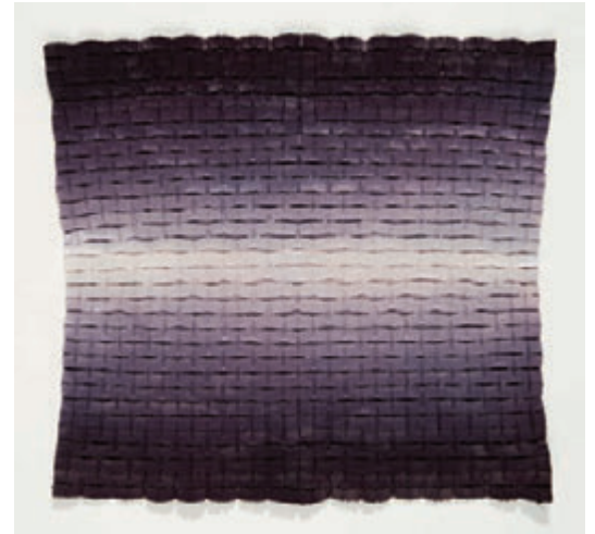
Change study 6: No twist 2 , 2012, dyed kozo paper, 16 x 17 inches

Goran Konjevod uses origami and paper folding techniques to transform single, flat sheets of paper into low-relief artworks with complex surfaces and patterns. "I hope to create objects of interest to others and to inspire questions. How does this work? What makes a sheet of paper take on a shape like that? Is this even paper? When and why does something change – from two dimensions to three, from flat to curved, from material to artwork?"