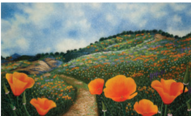
California Poppy Field #1, 2012, silk embroidery, 22 x 35 inches