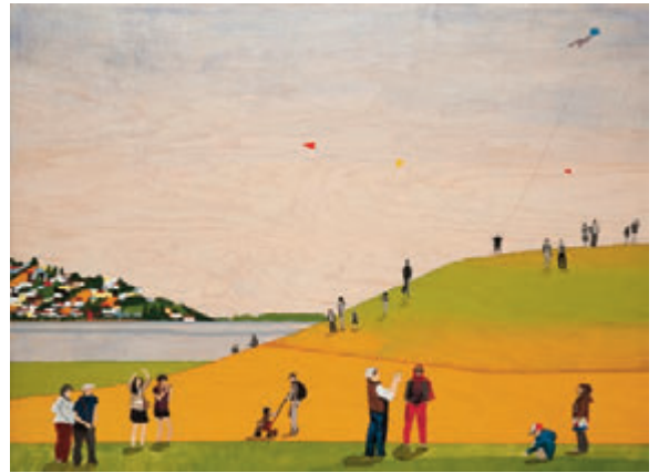
Kite Festival, 3 p.m. (Berkeley, CA), 2012, silkscreen on Gampi paper overlaying paper cut-out and watercolor pigment on wood panel, 22 x 30 inches

Vicky Mei Chen's series of mixed media works are inspired by the everyday scenery of the region – natural resources, landscapes, man-made creations, and people. "I hope the viewers will enjoy the quiet yet joyful scenes and feel a sense of belonging. The familiar pictures will remind them of the beauty we are surrounded by."