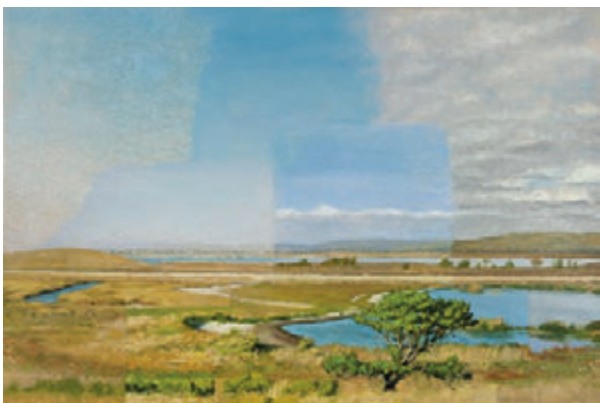
Coyote Hills , 2012, oil on wood panel, 24 x 36 inches