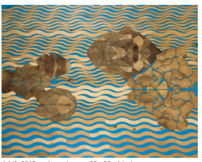
Adrift, 2015, cedar and epoxy, 28 x 36 x 1 inches