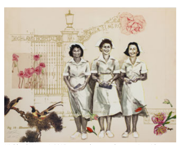
Highland Nurses 1, 2015, watercolor, gouache, aquatint with soft ground etching, color photocopy, gold leaf and chine collé, 30 \times 38 inches