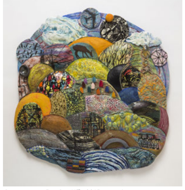
Patternscape: East Bay Hills, 2015, ceramic, 19 x 17.5 x 2 inches

Tiffany Schmierer's ceramic sculptures are inspired by places throughout Alameda County including the hills, bay, gardens, and the annual County Fair. Schmierer combines images of the natural world and man-made elements that make up the landscape of the Bay Area. Each piece is full of details, colors, textures, and patterns that are found in each location. Schmierer hopes to evoke positive memories and "bring these wonderful places into the hospital and to transport the viewer to a place of exploration."