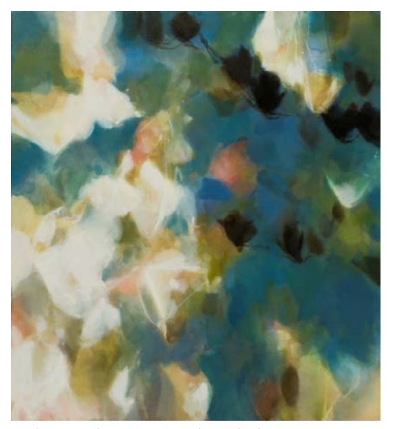
Enduring Light 1, 2015, acrylic and oil on canvas, 40 x 36 inches