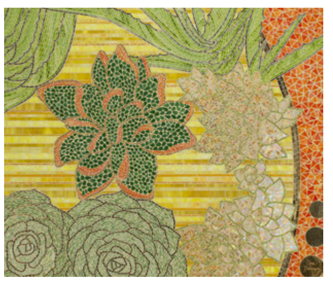
Summer Succulents, 2015, stained glass mosaic, 33 x 39 inches