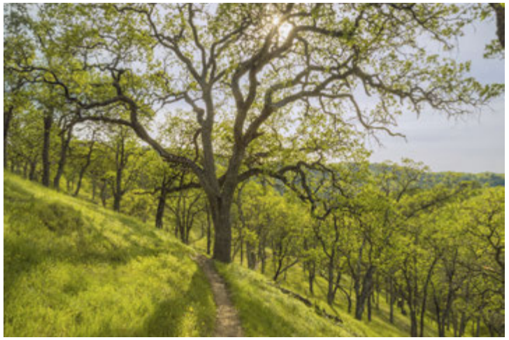
Backlit Spring Foliage on Blue Oak, Lake Del Valle Regional Park, Alameda County, California, 2015, photograph: archival dye sublimation print on semi-gloss white aluminum substrate, 32 x 48 inches

Rob Badger's photographs celebrate the beauty of Alameda County's natural outdoor spaces and encourage a sense of peace and relaxation. Badger states, "The natural world attracts our attention, and positively stimulates our senses and emotions. Positive images of nature have similar effects, so one does not need to be in a natural environment to experience the benefits."