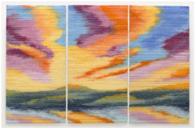
Sunrise, 2015, glass, pâte de verre method, 28 x 44 x 1.5 inches

Susan Longini's glass artworks celebrate the daily transitions of sunrise and sunset and are meant to be metaphors for the natural changes in our lives. Longini states, "Sunrise is a metaphor for new beginnings — of the day, an era, new possibilities, and hope — while a vibrant and colorful sunset is a metaphor for the end of a full day, an era, or a life fully lived."