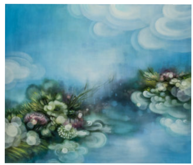
Tranquil Dreams, 2015, oil on panel, 36 x 42 inches

Jenn Shifflet's oil paintings embody tranquility. The cloud and plant-like forms are soft and dreamy. The calm, serene, watery and sky-like imagery gives a feeling of light scattered across a surface. She develops her paintings through many layers of mostly transparent paints built up over time. This results in a sense of space and luminosity. Shifflet says, "My hope is that this work provides a moment of peace for all who view it."