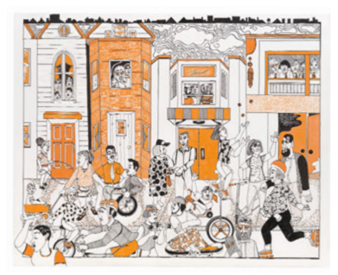
We Move, 2015, acrylic paint and India ink on museum board, 32 \times 40 inches

Ajuan Mance's playful drawings are snapshots of everyday life found throughout many parts of Alameda County. The settings depicted were selected because they each capture a type of location that exists in cities throughout the Bay Area: a street scene, marina, and farmers market. When looking at these drawings, Mance hopes people will "feel joy in the unexpected and comfort in the familiar" and "see something of themselves and their community in each drawing. The images depict everyday moments — flying a kite, eating ice cream, chatting with a friend on the sidewalk, or shopping for vegetables."