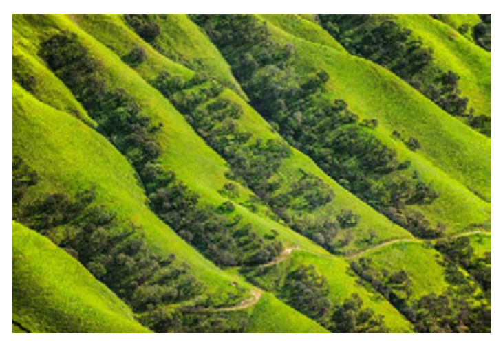
Ridges Near Lake Del Valle, 2015, digital photographic image on Epson Premium Photo Paper, 30 x 45 inches

Barrie Rokeach's aerial photography provides a unique view of Alameda County. The photographs were taken from a small aircraft high above the landscape. The images are engaging and thought-provoking while also quiet and serene. In talking about his process of capturing the image, Rokeach states, "As I circle around a form, observing the lighting, shadows, textures and colors transforming, at some point the intensity heightens and formalizes in my mind."