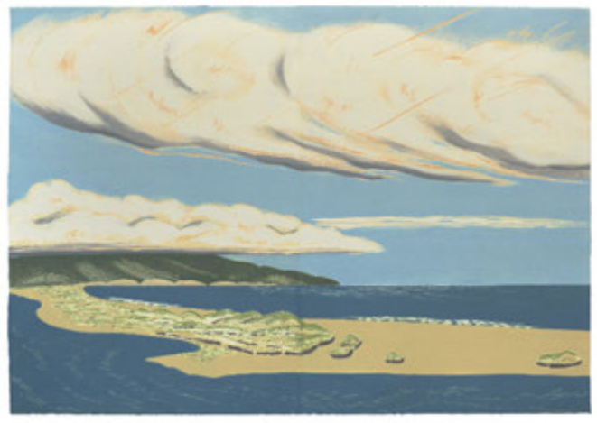
View from Drakes Head, South 2015.1, 2015, monoprint, 28 x 40 inches

Each artist created a small series of new artworks for the Acute Care Tower. This brochure features one artwork by each artist along with a short statement about their artwork.