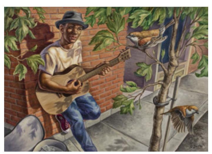
Encounters: Street Corner, 2015, oil on panel, 24 x 34 inches